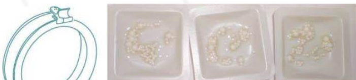
Figure 3: homogenized liver samples (vial 1, vial 2, vial 3)