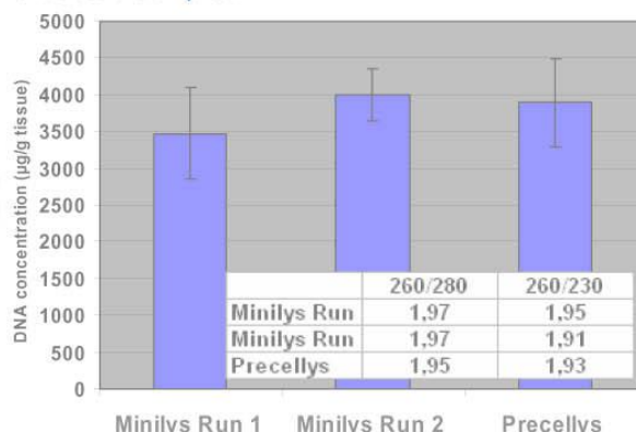
Figure 1: mean concentration of total genomic DNA from 3 extracted samples of liver tissue with Minilys (run 1 and 2) in comparison with Precellys. The corresponding mean absorption ratios (260/280; 260/230) are also plotted.

Equivalent total genomic DNA is obtained with Minilys homogenizer. High quality DNA is obtained from all extracted samples.